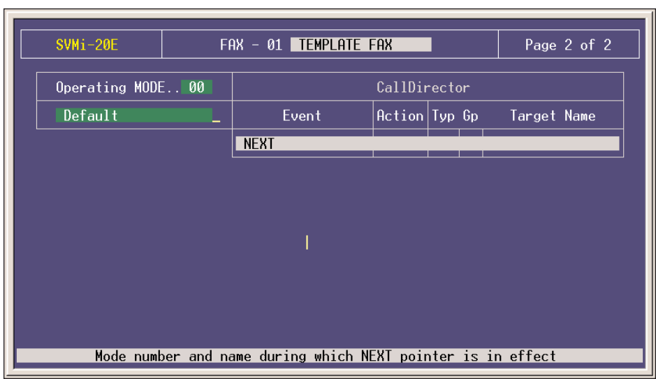
Fax Block Page 2 of 2

Indicates the Mode Name and Number for which the displayed Block Pointers' Targets are active. Each Operating Mode is given a unique Number by the system. Valid numbers are 01 99, and are assigned in sequence as new Modes are created. Pressing ENTER at this field opens a Pointer Mode Target Generator, from which an existing Mode Name may be selected, or a new name may be entered. Entering a new name creates a new Mode with its corresponding Number. The Mode Number and Name are associated with the Block's Pointers, not the Block itself. This allows one Block to route calls to different destinations in different Modes, using different Targets for the pointers' various Mode references. For example, the No-Answer pointer might route callers to an associates' Extension during the 'Day' Mode, but after 5:00 PM, it would route them to a Mailbox during 'Night' Mode. The SVMi-20E will display Default Mode pointers in a block while viewing pointers in another mode. The Default Mode pointers will be grayed out to denote that they are not in the current mode.