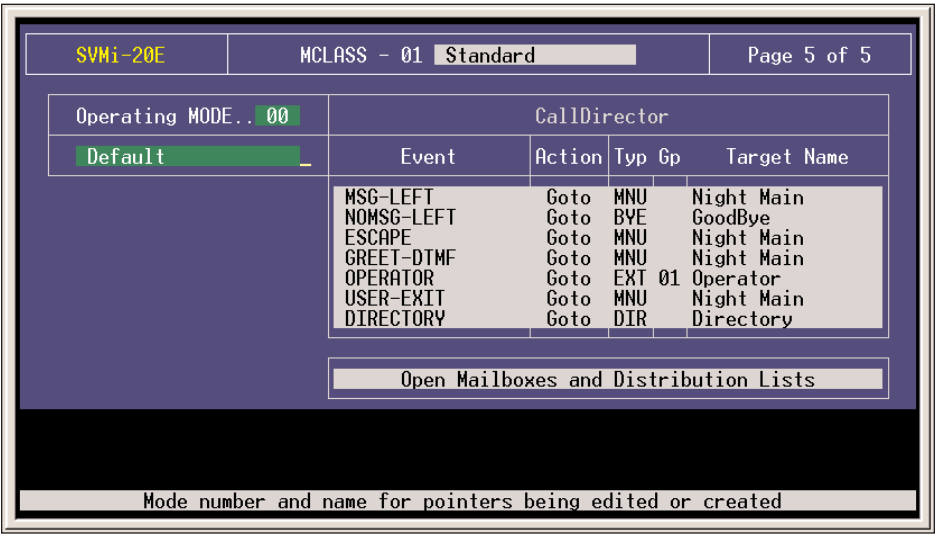
MClass Block Page 5 of 5

† Important Note: As in many references in the SVMi, "number of Days" is calculated at Daily Maintenance time not a 24 clock. Also, to allow for messages that come in after hours, the first running of Daily Maintenance is skipped. So, a retention of 1 means the original voice message will be deleted after the 2nd time daily maintenance runs. For Example: You leave the office at 5:10PM. A new message is left for you at 6:30PM. If you are using the EMG, your MWI is immediately turned on and the message is also sent to your INBOX. If we did NOT skip the 1st Daily Maintenance Time, when you came in in the morning, you would not have any indication on your phone to let you know that messages came in after you had gone home for the evening.