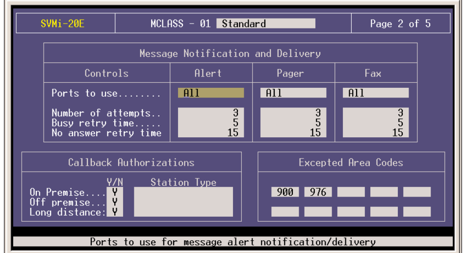
MClass Block Page 2 of 5