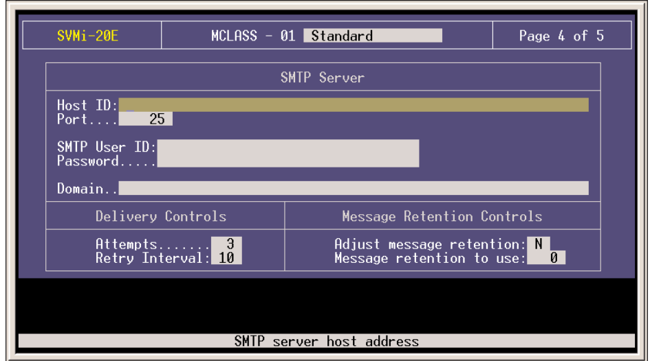
MClass Block Page 4 of 5

BEEP BEFORE RECORDING Enables a beep to play prior to recording conversations.