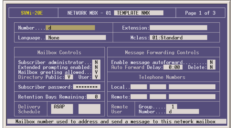
Network Mailbox Block Page 1 of 3