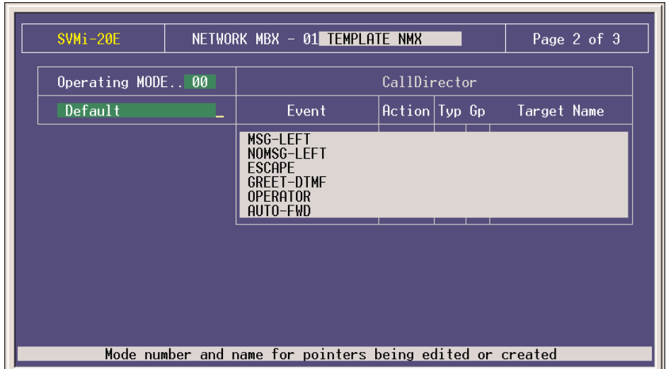
Network Mailbox Block Page 2 of 3

NUMBER If this is a Proxy NMX, enter the Subscriber's Mailbox Number at the remote location. If this is a Site NMX, leave the field blank. If the number entered is a Distribution List Mailbox on the remote site, all members of the List will receive messages sent to this NMX. Note: Public callers can only send messages to proxy NMXs. The number is identified with the name of the mode.